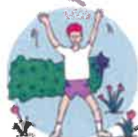
5. Take your workout outside