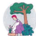
4. Forage for fruit and flowers