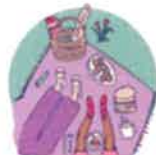
6. Have a picnic