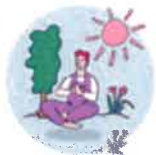
7. Practice mindfulness