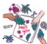
8. Get crafty