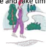
2. Discover new walks