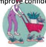
1. Do some gardening