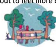
3. Nature spotting